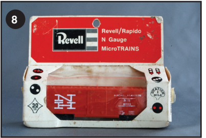
Revell/Rapido part # N2503, New Haven # 4003