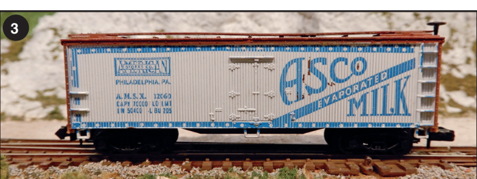
Arnold Rapido part # 0483 A, Asco Milk #12060