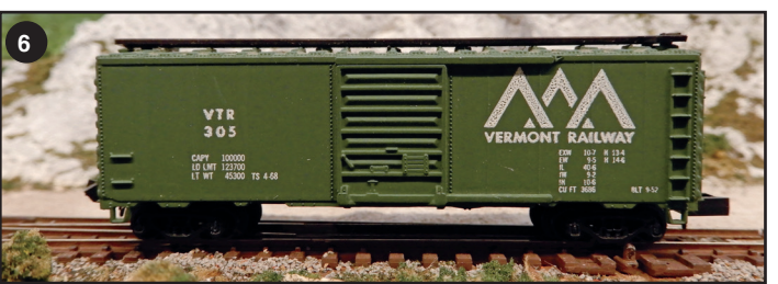
Atlas part # 5002-129, Vermont Railways # 305