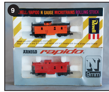
Revell/Rapido part # N-2597, Western Pacific caboose # 754, Rapido part # 0481 S, A.T.& S.F caboose # 1957