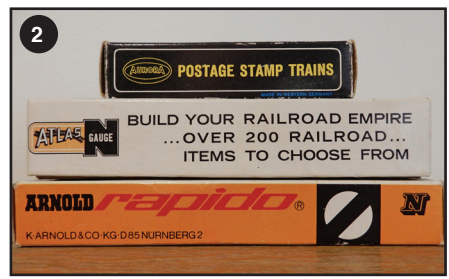
Arnold Rapido part # 0483 A, Aurora (MInitrix) part # 4880/260, Atlas part # 5002-129