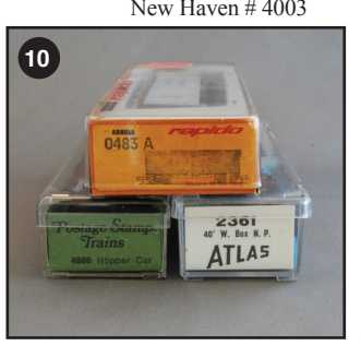
Arnold Rapido part 0483 A, Aurora (Minitrix) part 4886, Atlas part 2361