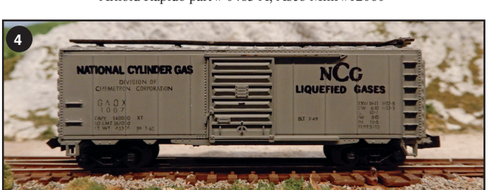
Aurora (MInitrix) part # 4880/260, National Cylinder Gas # 1007