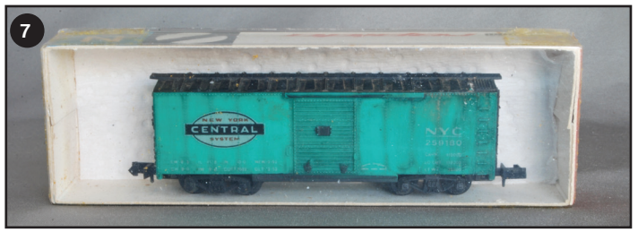
Arnold Rapido part # 0412, New York Central 259180