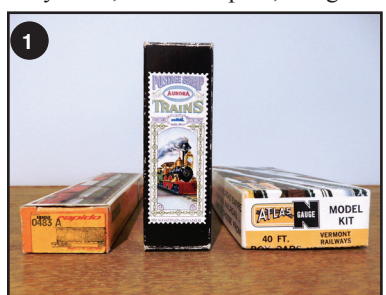
Arnold Rapido part # 0483 A, Aurora (MInitrix) part # 4880/260, Atlas part # 5002-129